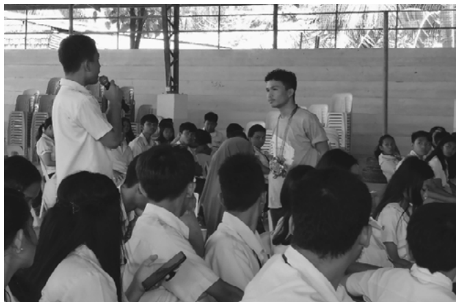
A student participates during the inaugural launching of the peacebuilding club.