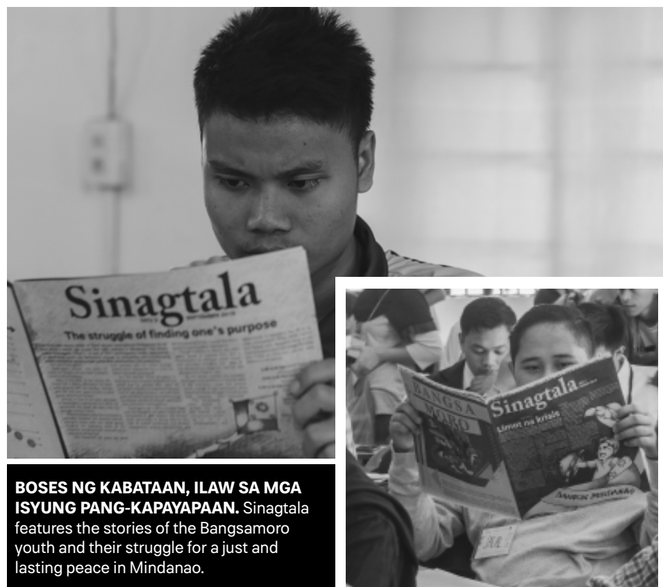
BOSES NG KABATAAN, ILAW SA MGA ISYUNG PANG-KAPAYAPAAN. Sinagtala features the stories of the Bangsamoro youth and their struggle for a just and lasting peace in Mindanao.