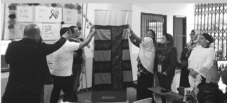
During the launching of the third Messaging Hub at the College of Social Sciences, Mindanao State University.